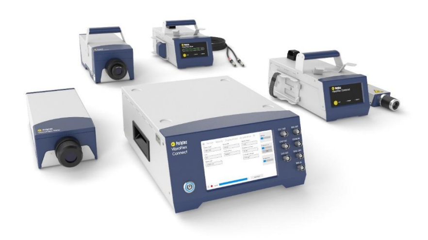
Pic. 1: The new member of the VibroFlex Family

makes vibration measurements faster, easier and more reliable than ever - for the most robust, unambiguous results. QTec represents a new quality in non-contact vibration measurements on engineered surfaces, utilizing the very last quantum of light for high-fidelity data under all conditions. QTec is designed to give simply the best Signal to Noise ratio (SNR) ever, especially for laterally moving or rotating objects, long distant or biological samples.