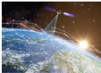
Satellite for earth observation