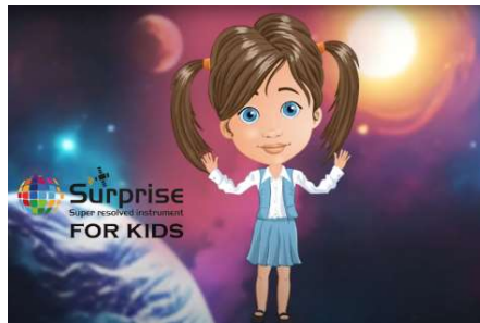
Explanatory video Surprise4Kids