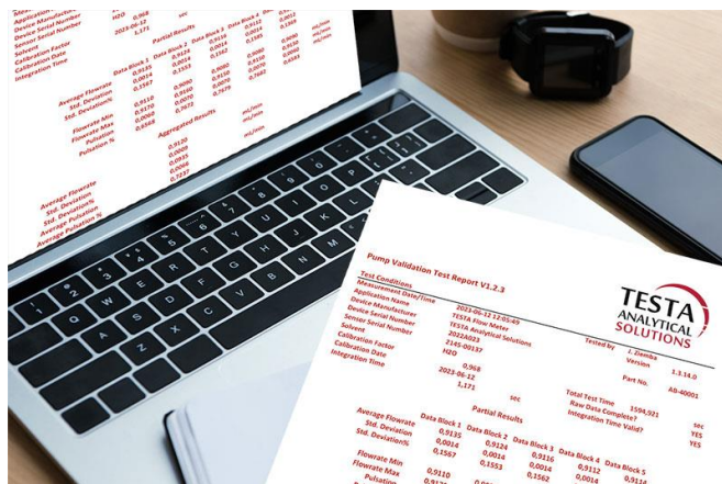
Caption: Audit ready HPLC Pump Qualification Pack