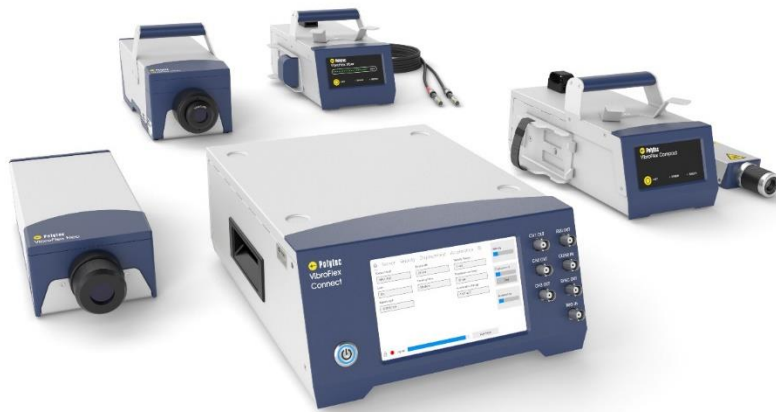
Pic. 1: The new member of the VibroFlex Family

makes vibration measurements faster, easier and more reliable than ever - for the most robust, unambiguous results. QTec represents a new quality in non-contact vibration measurements on engineered surfaces, utilizing the very last quantum of light for high-fidelity data under all conditions. QTec is designed to give simply the best Signal to Noise ratio (SNR) ever, especially for laterally moving or rotating objects, long distant or biological samples.